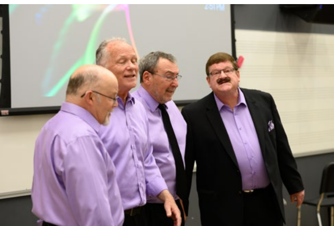
Barbershop singing workshop

In addition to the choir clinics, the festival programming included workshops held at the University of Windsor’s School Of Creative Arts. Workshop topics included vocal jazz, singing in other languages, barbershop singing, drum circles, and a special workshop on choir marketing and audience development hosted by Choirs Ontario. Anne Longmore, director of marketing and community outreach with Toronto Mendelssohn Choir led the workshop, offering choir directors and board members valuable tips and information on growing the choral community.