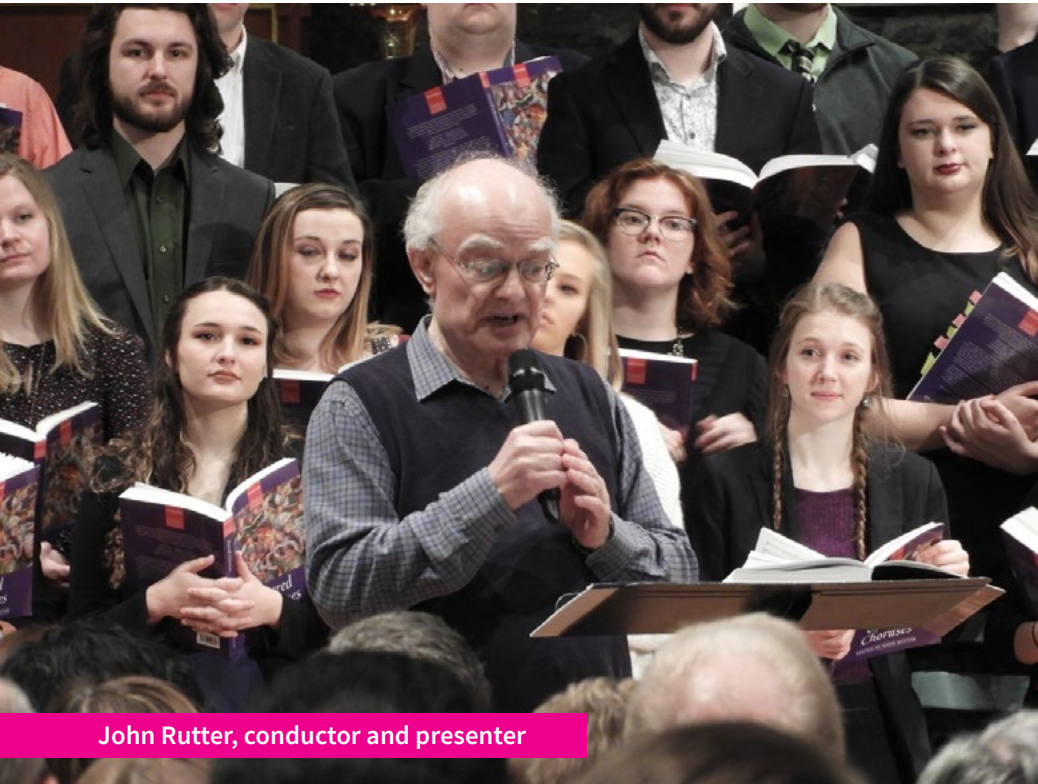
John Rutter, conductor and presenter

regular conference fee, student and retired rates will be available once again. Registrants are all required to become members of the ACDA if they haven't already joined the organization. Rates for the conference and membership fees for ACDA are extremely reasonable. Participants in the conference receive outstanding value for their money as the fee covers all concerts and interest sessions. Furthermore, membership in ACDA comes with a long list of benefits which includes access to resources on the organization's website, ACDA Radio, and a monthly subscription to the Choral Journal. For further information about the American Choral Directors Association and its activities, visit: https://acda.org