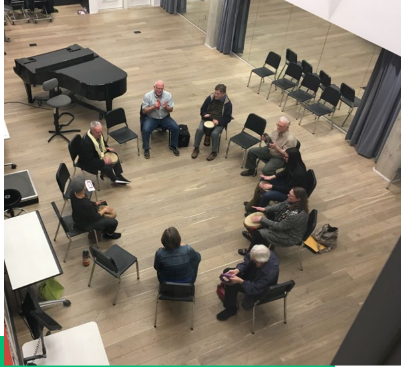
Drum circle workshop