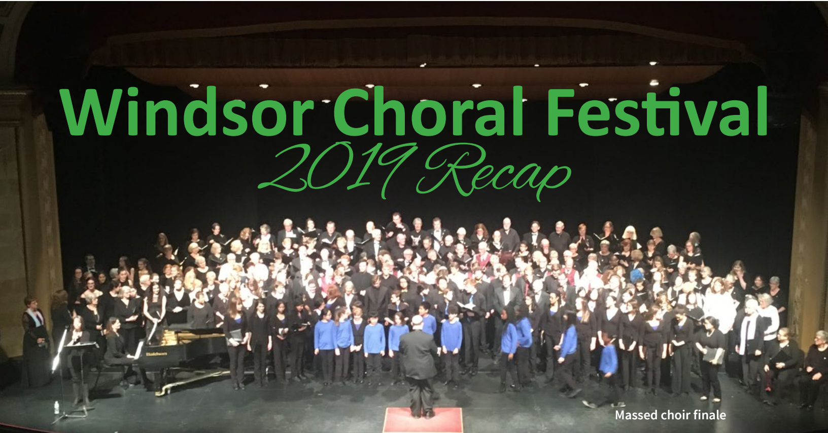
Massed choir finale